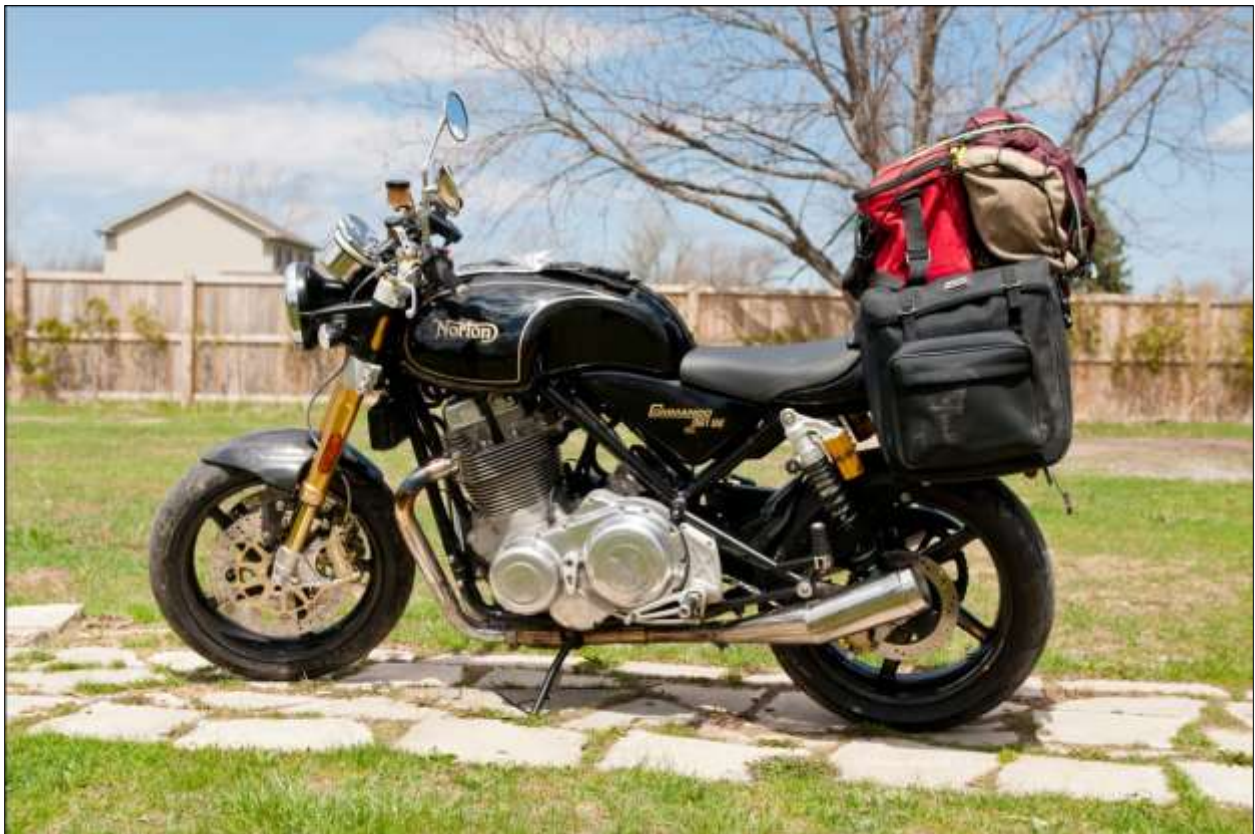
2013 Norton Commando SE #107 with Luggage ready to Leave for Texas from Niagara Falls.

If there are any tools in this manual you would like to purchase, please email me at richard@coote1.com for prices and availability. We are slowly developing useful tools to help make it easier for you to work on your pride and joy.