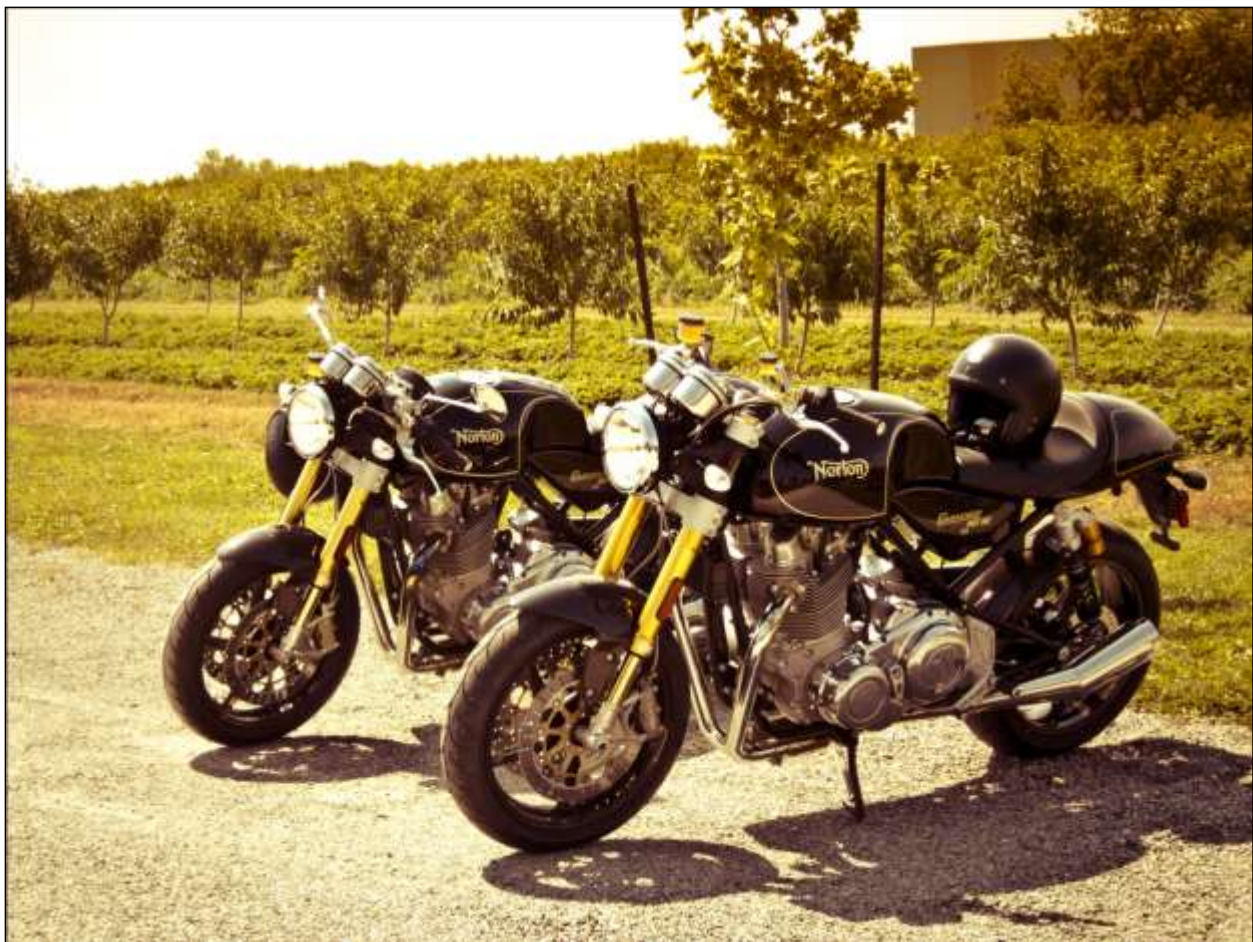
2013 Norton Commando SE #107 (left) 2014 Norton Commando SE#112 (right)

If there are any tools in this manual you would like to purchase, please email me at richard@coote1.com for prices and availability. We are slowly developing useful tools to help make it easier for you to work on your pride and joy.